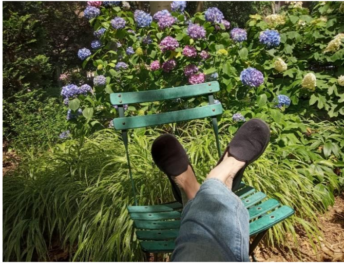
It's summer – put your feet up!