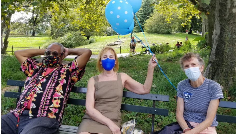
Saturday in the Park with Second