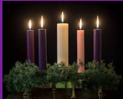
Advent candles herald the coming of the Light.

The season of Advent begins on the fourth Sunday before Christmas which this year means it begins on December 3 rd . Nowadays it hardly feels like a separate season as Christmas shopping officially kicks off the day after Thanksgiving with